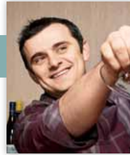
Gary Vaynerchuk Founder and CEO, Wine Library; author, The Thank You Economy