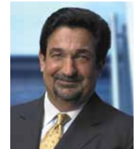
Ted Leonsis Founder, chairman, and majority owner, Monumental Sports & Entertainment; vice chairman emeritus, AOL; founder, SnagFilms

and critics into supporters while remaining committed to her vision. We all know taking an idea from creative concept to elaborate execution isn't for the meek or weary. Learn how trusting your gut and focusing on the unconventional can lead to unbounded results.