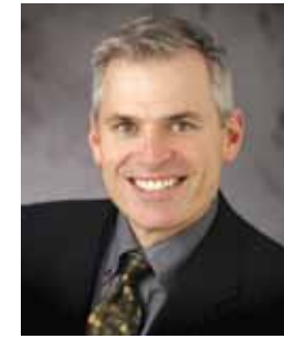
Patrick Lencioni Founder and president, The Table Group