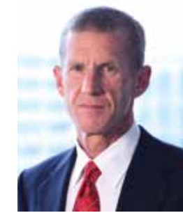
General Stanley McChrystal Former commander, U.S. and international forces in Afghanistan