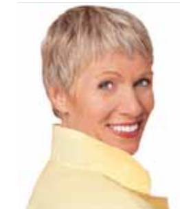
Barbara Corcoran Real estate expert; star of the ABC television show Shark Tank ; author, Shark Tales: How I Turned $1,000 into a Billion Dollar Business